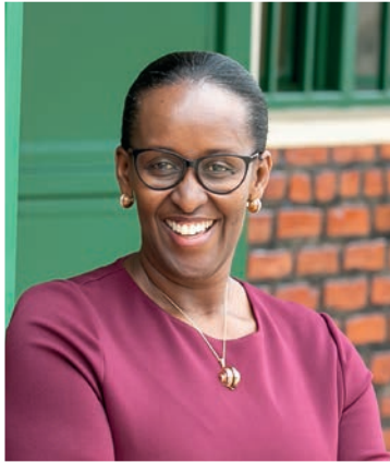
Her Excellency Mrs Jeannette Kagame First Lady of the Republic of Rwanda and Chairperson of Imbutu Foundation

The First Lady of the Republic of Rwanda, Mrs Jeannette Kagame personifies an active, relentless and passionate devotion to uplifting the lives of vulnerable populations in Rwanda; particularly those of widows, orphans of the genocide and disadvantaged families. As the nation's First Lady, Mrs Kagame has admirably balanced family, social life and philanthropy, not only in her own country but continentally, and worldwide.